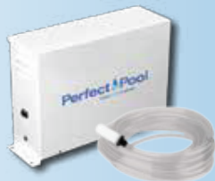
Perfect Pool Ozone Generator + 100ft tube and diffuser