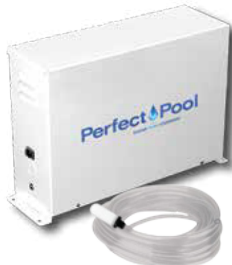
Perfect Pool Ozone Generator + 100ft tube and diffuser