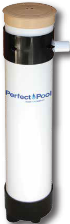
Perfect Pool In-Deck Module with Filter