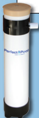
Perfect Pool In-Deck Module