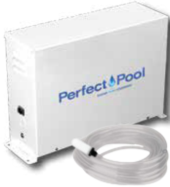
Perfect Pool Ozone Generator + 100ft tube and diffuser