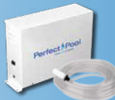
Perfect Pool Ozone Generator + 100ft tube and diffuser