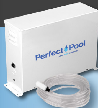
Perfect Pool PP-3 In-Deck Filtration & Ozone Generator + Diffuser