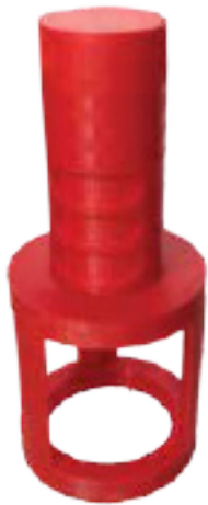
Chlorine Cartridge Kit (shown assembled)