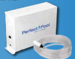
Perfect Pool Ozone Generator + 100ft tube and diffuser

Compatible with Gunite, Fiberglass and Vinyl pools - Will not harm pool covers!