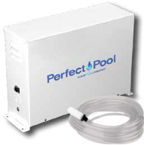
Perfect Pool Ozone Generator + 100ft tube and diffuser

Ozone is safe, effective and reliable. Ozone is a form of oxygen and it is produced naturally through sunlight and lightning. It is one of nature's most powerful Oxidizers and reacts two thousand times faster than chlorine.