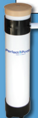
Perfect Pool In-Deck Module with filter