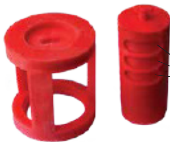
Cartridge Mount (Comes with the PP-1 and PP-2 In-Deck Modules)